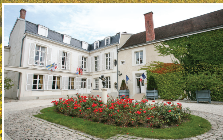
Inset image: Deutz Champagne House.

We have carefully selected well-located four and five-star hotels (with top class comfort and very comfortable Michelin ratings) that provide high quality and good value for money. All the hotels have clean, comfortable rooms with private facilities. Some of the hotels will provide an enjoyable "European style" experience, rather than the uniformity of standardised modern hotels.