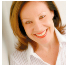
WORDS ELISABETH KING